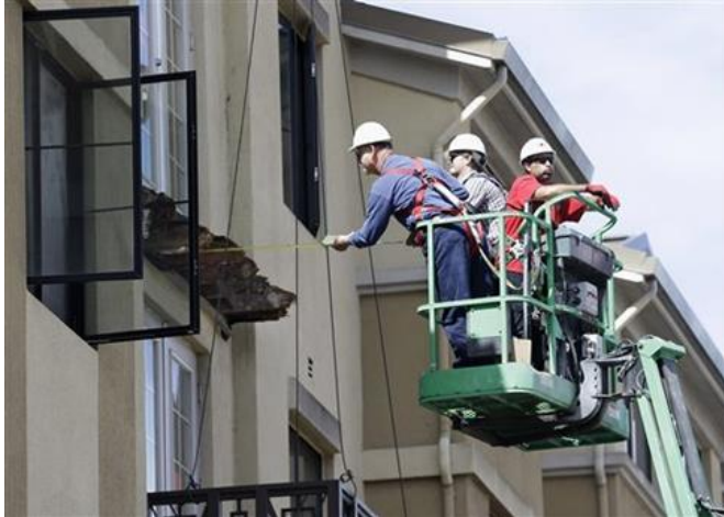
Workers inspect damage from a fallen balcony that resulted in the deaths of eight Irish tourists. Negligence in this case can apply to virtually everyone involved with the building, the San Francisco Examiner determined.

Many property owners believe that ignorance is a good defense against liability, and that the identification of vulnerable buildings may secure their legal responsibility if their building is on the list. Knowledge that a building is potentially unsafe doesn't have to come from a city notice. Risk can also be officially conveyed in documents prepared by banks and lending institutions, insurance companies and any other industry that does building assessments as a part of doing business.