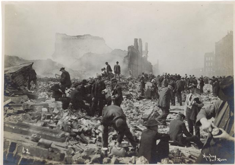
The San Francisco quake of 1906 left 300,000 people homeless. California has more than a 99 percent chance of another major quake happening in the next 30 years.